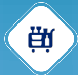
FOOD AND BAR TROLLEYS